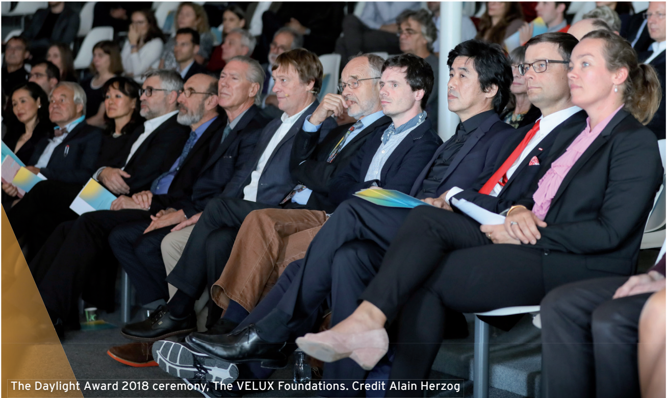
The Daylight Award 2018 ceremony, The VELUX Foundations.