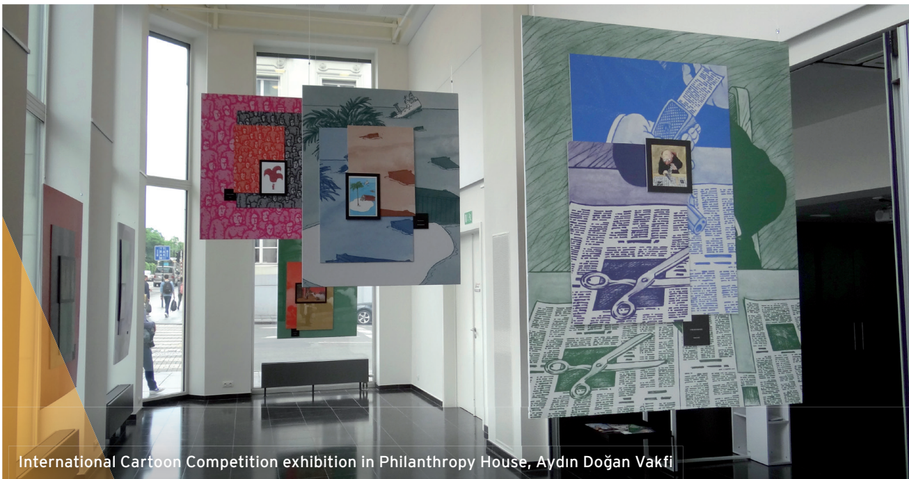
International Cartoon Competition exhibition in Philanthropy House, Aydın Doğan Vakfı